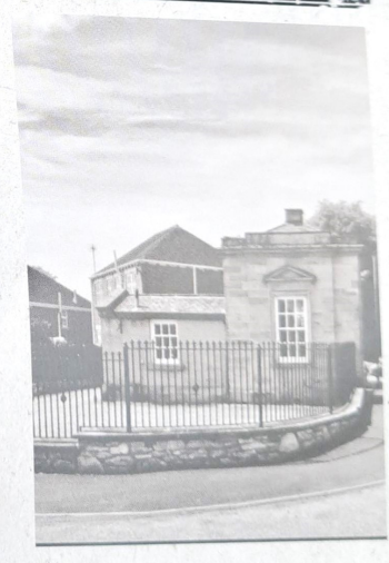
The Old Gatehouse Byram Park Rd, Byram, Knottingley, WF11 9EA