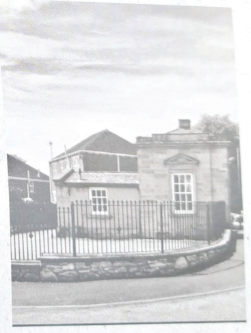
The Old Gatehouse Byram Park Rd, Byram, Knottingley, WFII 9EA