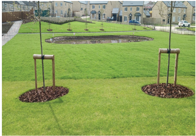
Hornbeam Gardens, Taylor Wimpey Development, Pit lane.